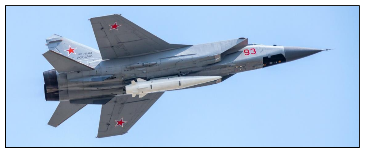
Figure 4: MiG-31 aircraft carrying Kh-47M2 Kinzhal.