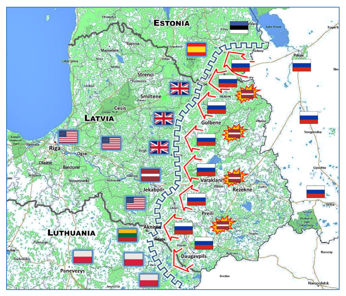
Figure 2: Baltic Sea war battle lines at the beginning of the second day

The war was going badly for NATO forces since the sudden attack across the Latvian and Ukrainian boarders the night before. Gulbene, Rezekne and Daugavpils had been immediately overrun as about eight Russian armored brigades (figure 2) stormed across the frontier between Russia and Latvia. Fighting was not limited to Latvia as Russian forces also moved into southern Estonia and northern Lithuania.